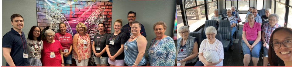
Shades of the Past ~ Abbey Agra